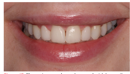
Figure 15: The patient was 'over the moon' with her smile transformation

A night guard was also fabricated to protect her new smile from the pre-existing clenching habit and a new upper whitening tray was made to enable the patient to maintain the new teeth shade.