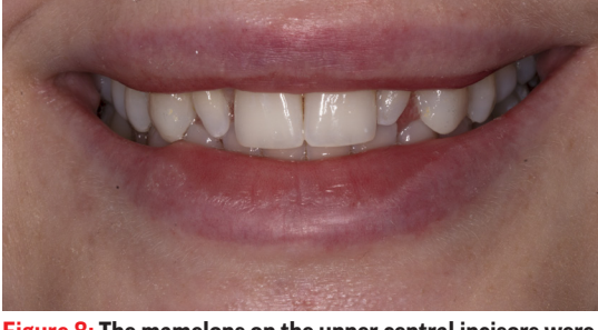
Figure 8: The mamelons on the upper central incisors were contoured and the peg-shaped lateral incisors prepared on the gingival margin

Finally, it was explained that the appearance of the pointed shape of the canines could partly be