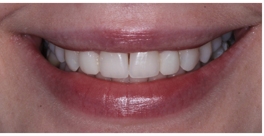
Figure 11: The patient requested that the temporary veneers be made shorter and less bulky