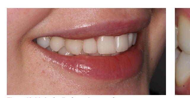
Figure 13-14: At the final appointment the permanent veneers were placed

A putty index matrix with Venus Pearl B1 shade was used to create the palatal shell using a layered technique but with a single shade (Figure 10).